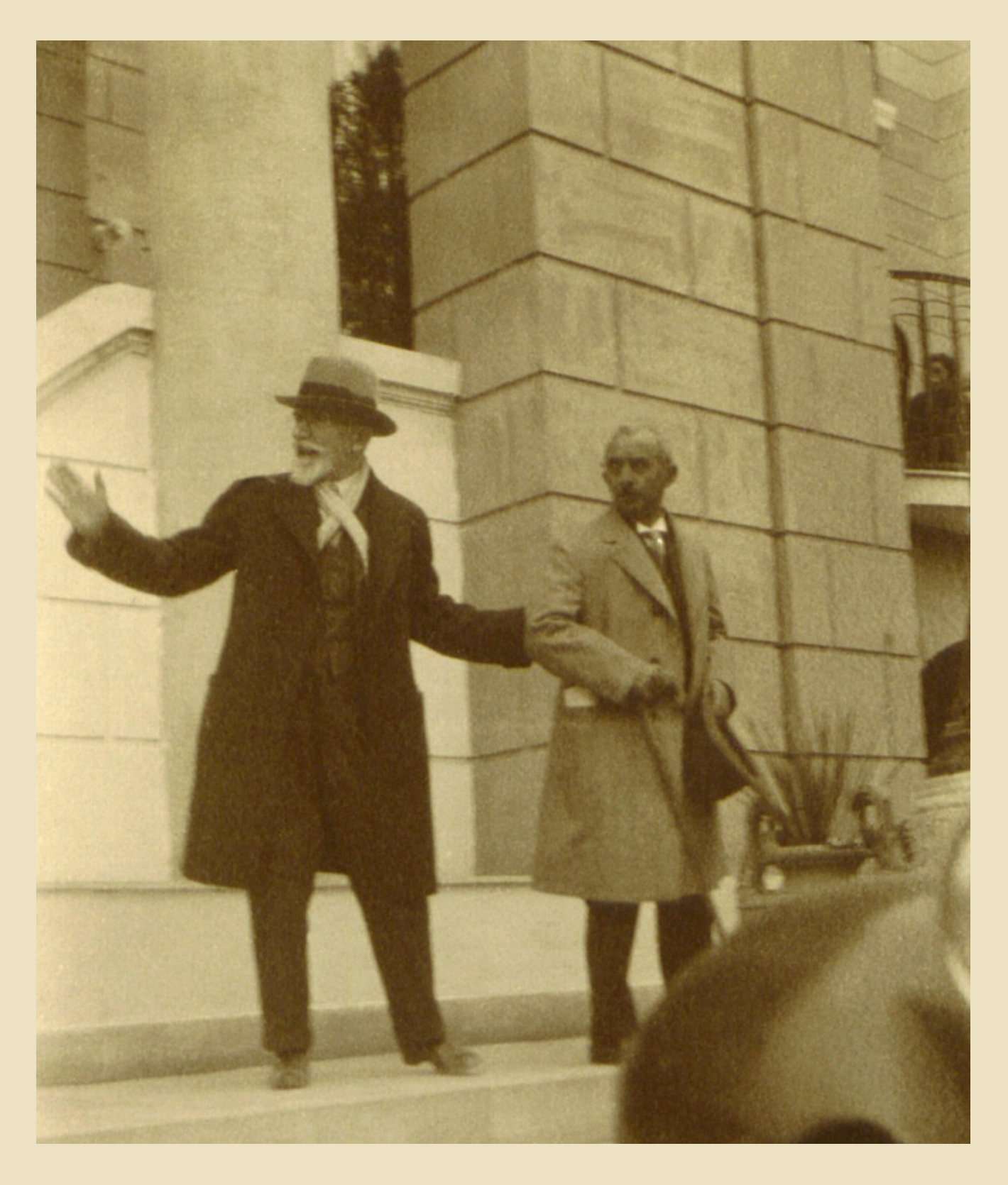
Eleftherios Venizelos with the Turkish Prime Minister Ismet Inonou during the latter's visit to Athens, 1931