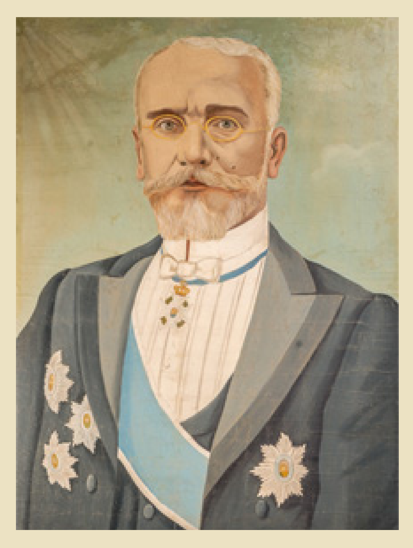
Portrait of Eleftherios Venizelos, 1927