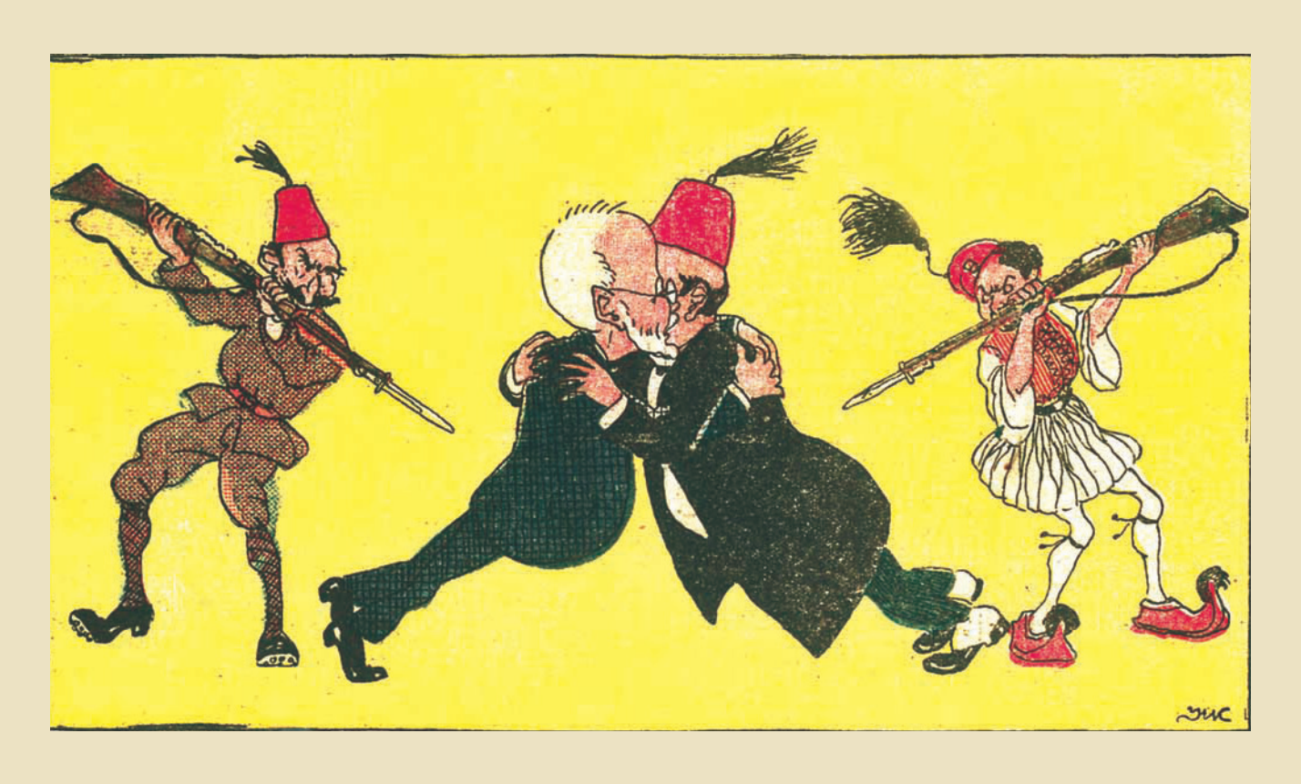
Caricature on the Greek-Turkish Treaty of Friendship, Ankara, 1930