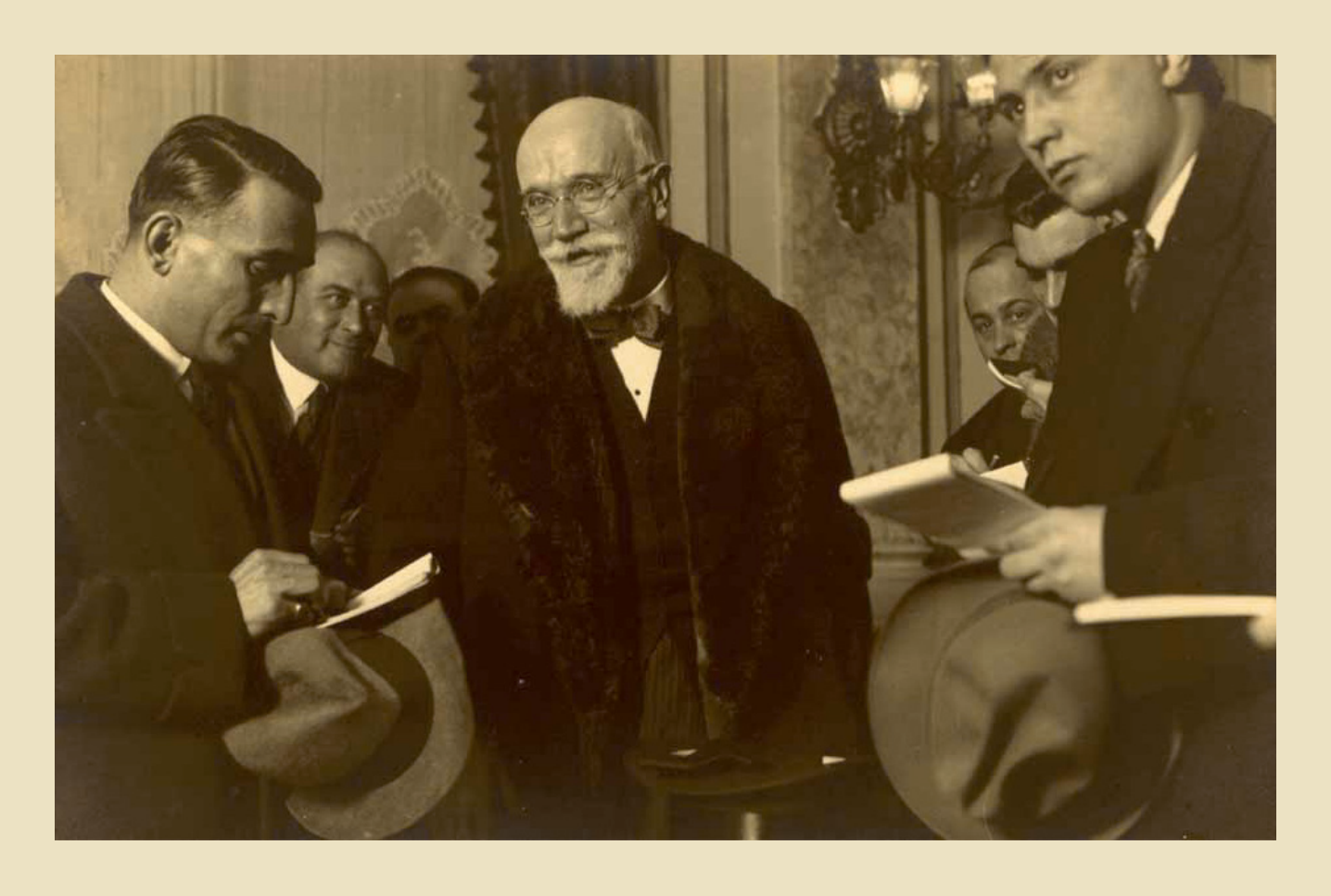
Eleftherios Venizelos, in an interview, during a visit in Belgrade, 1928