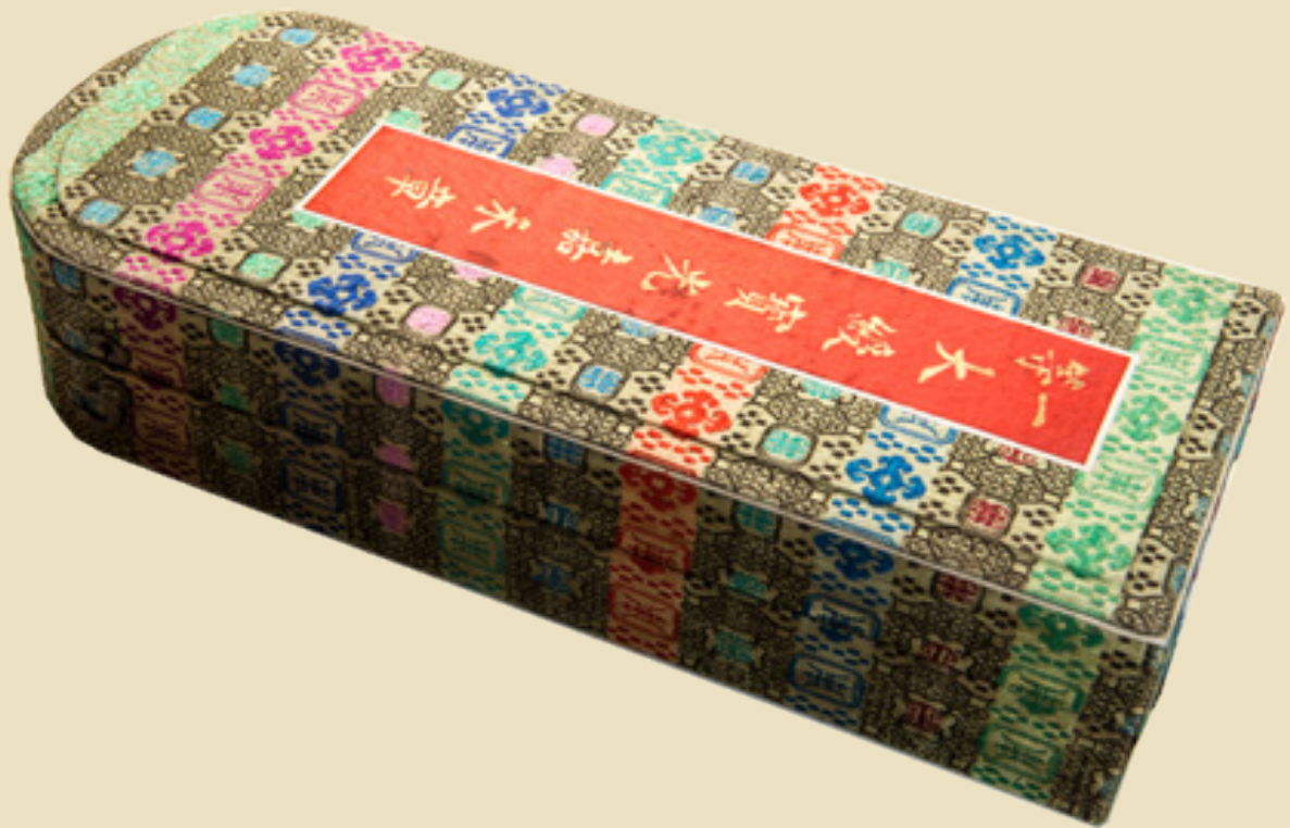
Badge Medal of Honor awarded to Eleftherios Venizelos by the Government of Japan