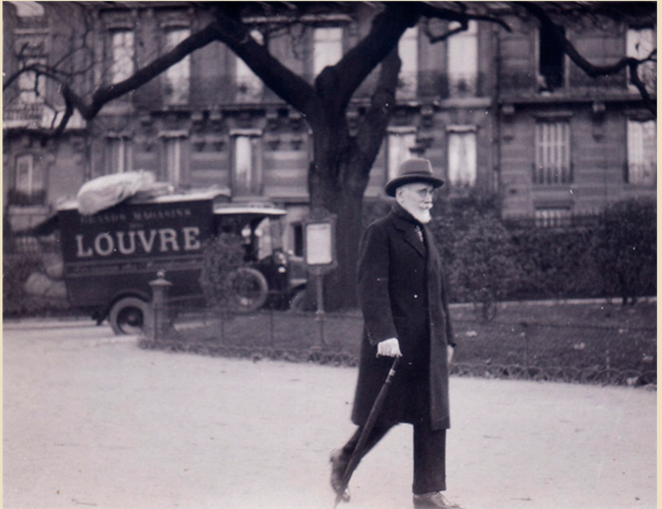
Shortly before his death during a walk in Paris