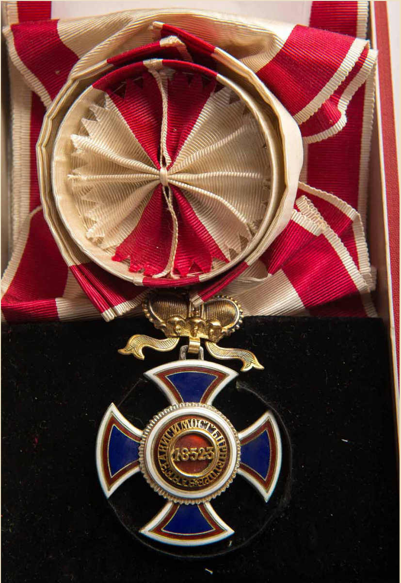
Grand Cross of the Order of Prince Danilo I of Montenegro awarded to Eleftherios Venizelos by the Government of Montenegro