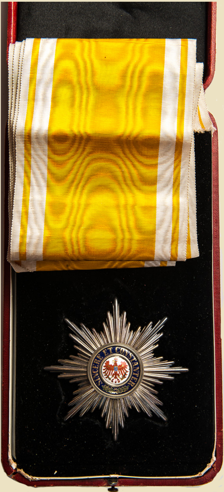
Badge of the Order of the Star of Romania (Der Ordens-Stern) awarded to Eleftherios Venizelos by the Romanian Government