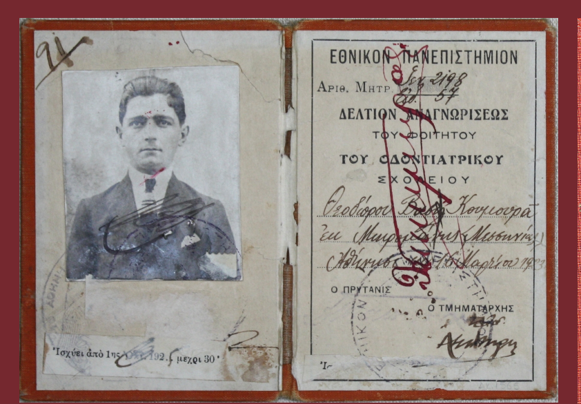
Student ID by the University of Athens, 1920s.