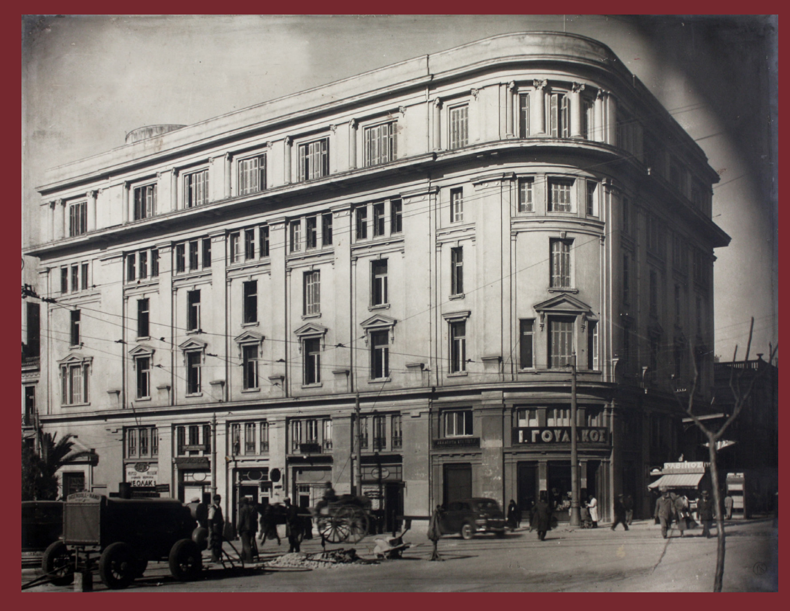
The University Club at the corner of Ippokratous and Acadimias Streets in the 1930s.

Historical Archive of the University of Athens