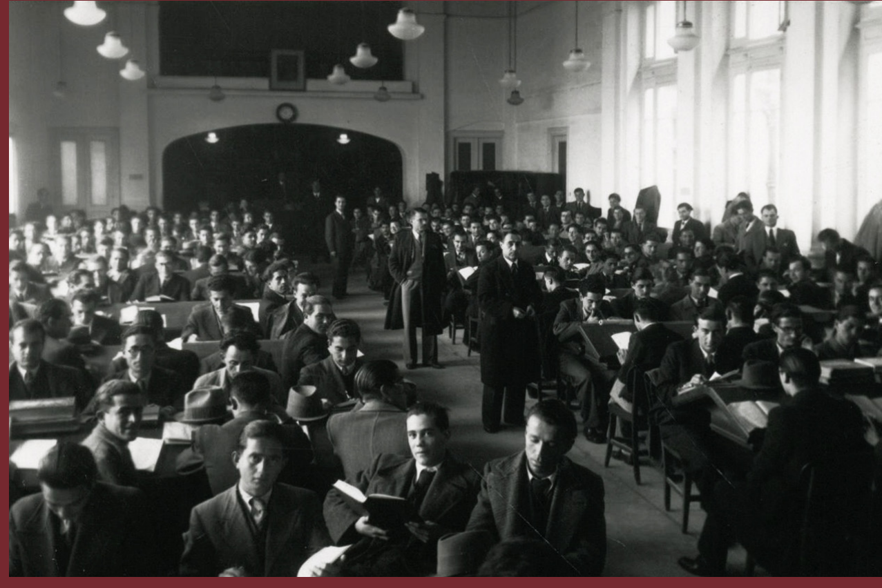
The reading room of the University Club, 1930s. Historical Archive of the University of Athens

Historical Archive of the University of Athens