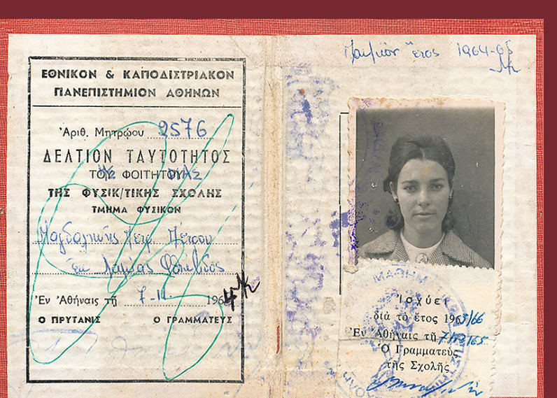
Student ID by the Physics Department of the University of Athens, 1964.

Historical Archive of the University of Athens