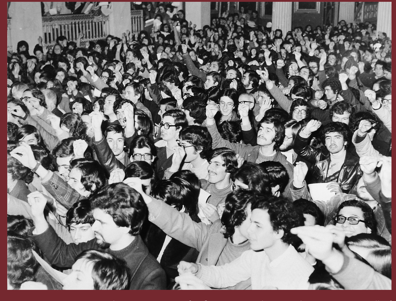
Welcome reception for first-year students at the Ceremony Hall of the University's central building 1976.

Historical Archive of the University of Athens