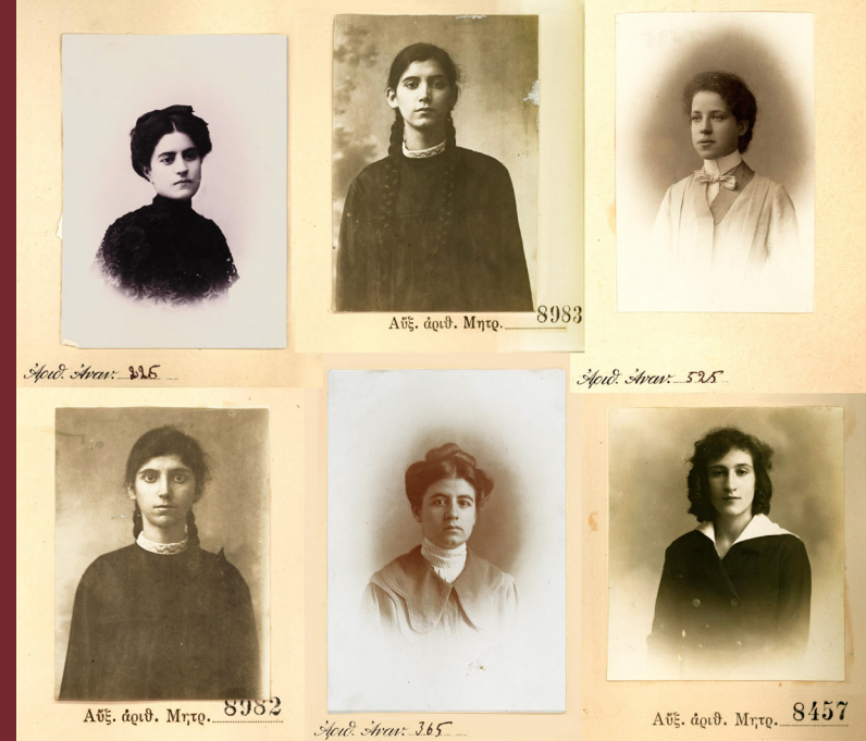
Female students' ID photos from the University's Enrolment Registry.

Historical Archive of the University of Athens