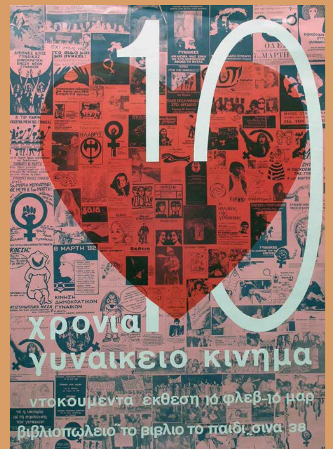
The poster for the exhibition "10 years of the Women's Movement" held at the bookstore The book/ The child "Delfys" Women's Archive