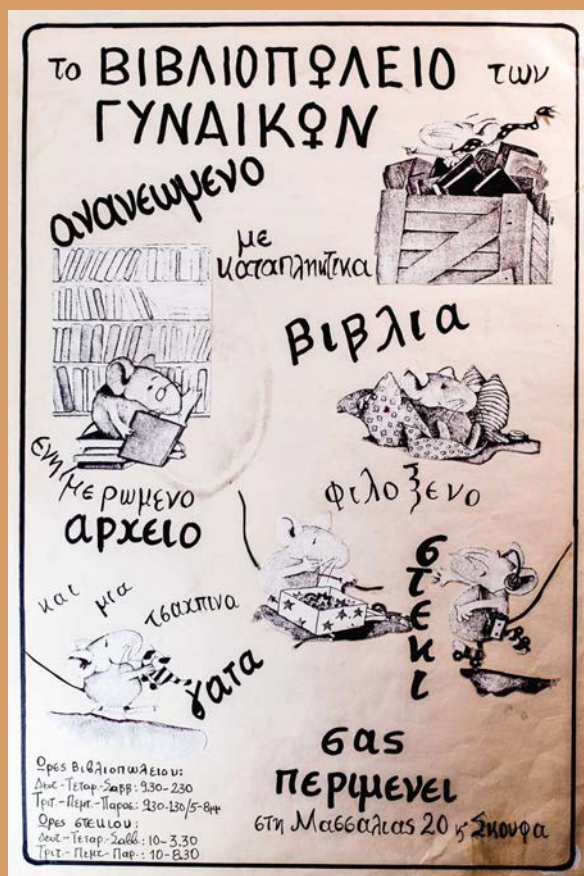
Women's Bookstore poster "Delfys" Women's Archive